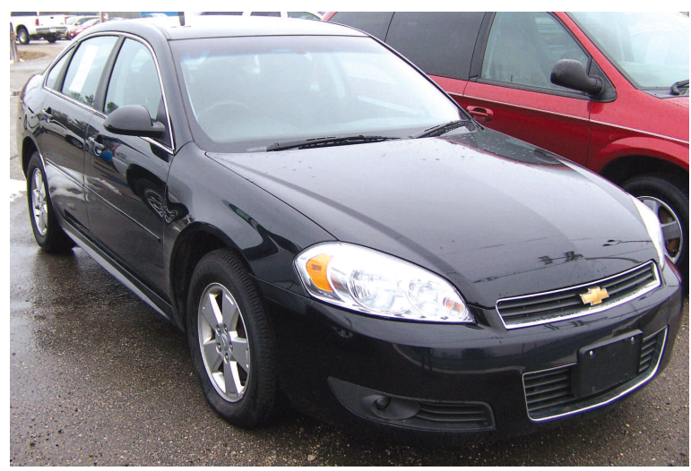
2010 CHEVY IMPALA