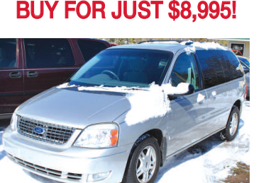
2005 FORD FREESTAR 7 passenger, loaded. $7,995 AS LOW AS $179 A MONTH TO QUALIFIED BUYERS