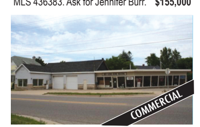
437 BOYNE AVENUE., BOYNE CITY This building has approximately 1641 sq fi of Showroom and 2443 sq ft of warehouse space totaling 4,084 square feet. MLS 430670. Ask for Holly Nierman. $169,900

109 MILL STREET • EAST JORDAN •231-536-7700