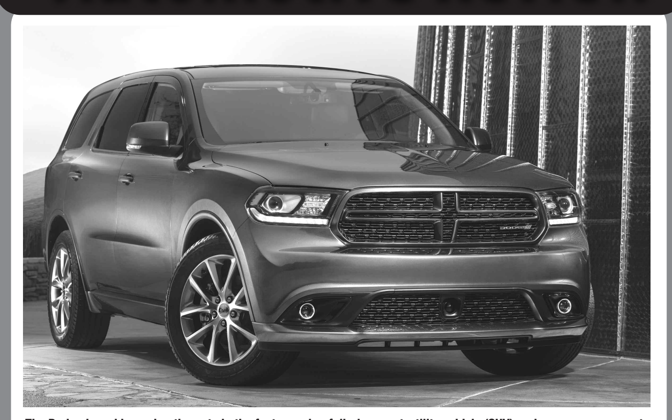
The Dodge brand is upping the ante in the fast-growing full-size sport-utility vehicle (SUV) and crossover segments, introducing the new 2014 Dodge Durango at the 2013 New York International Auto Show.